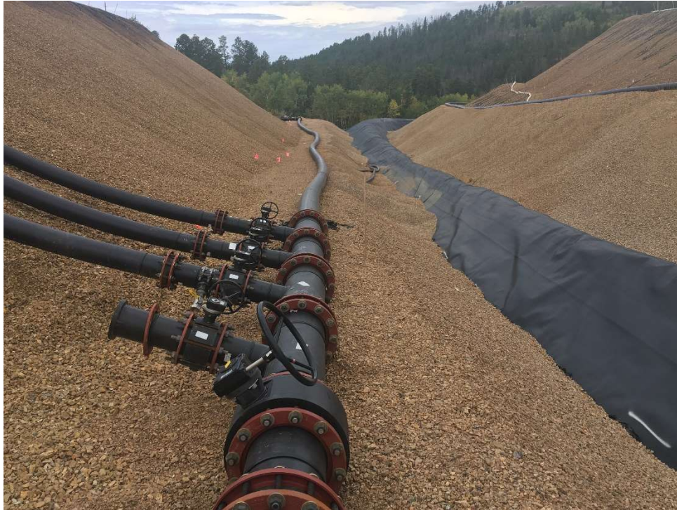
AVK S891 PE WAFER TYPE BUTTERFLY VALVES